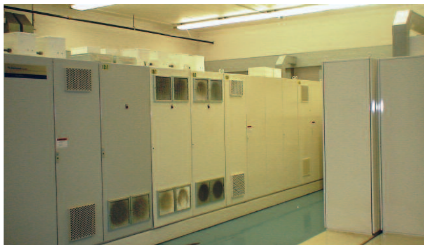
POWER IS FILTERED AT THE DRIVE CABINETS BECAUSE OF THE AMOUNT OF SENSITIVE EQUIPMENT IN A HIGH VOLUME ACTION AREA.

The system also protects equipment against power surges due to lightning strikes, or oversupply of voltage. A surge can last up to 50 microseconds, and although very short in